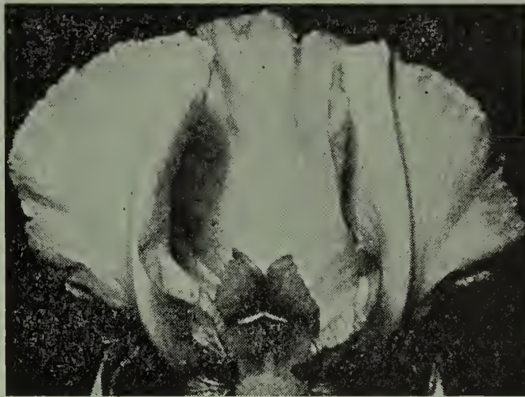
Los Angeles Iris